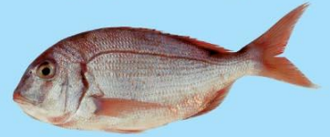
Besugo - Red Snapper (Pagrus pagrus) Entero en bloque - Whole round in block 200 to 2000 grms