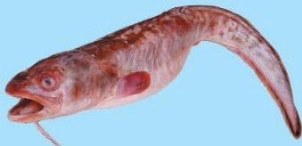
Abadejo - Kingclip (Genypterus Blacodes) Filet sin piel interfoliado Skinless, interleaved fillets 100 to 1500 grms