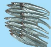
Cornalito Silverside (Sorgentinia Incisa) Entero en bloque - Whole round in block 4 to 10 grms