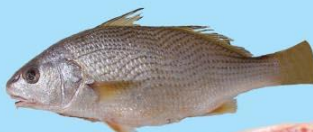
Pargo - Argentine Croaker (Umbrina Canosai) Filet sin piel interfoliado Skinless, interleaved fillets 50 to 360 grms