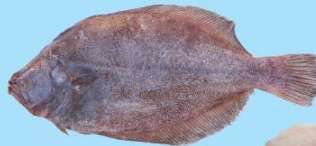
Lengua - Flounder (Paralichthys Spp) Filet con piel interfoliado Skin on, interleaved fillet 1 to 12 onzas