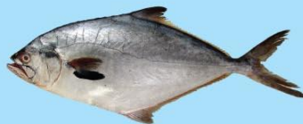
Palometa - Pompano (Parona Signata) Filet sin piel interfoliado Skinless, interleaved fillets Filet con piel interfoliado Skin on, interleaved fillet 50 to 360 grms