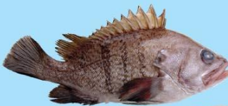
Mero - Grouper (Acanthistius Brasilianus) Filet sin piel interfoliado Skinless, interleaved fillets 1 to 12 onzas