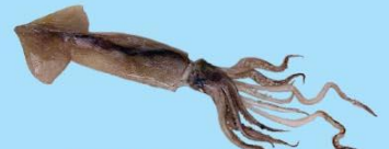
Calamar - Squid (Illex Argentina) Entero en bloque - Whole round in block, 100 a 500 grms Aleta en bloque - Fin in block Tentaculo en bloque - Tentacle in block Tubo en bloque - Tube in block