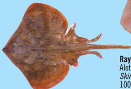
Raya - Skate (Raja Spp) Aleta de raya sin piel interfoliado Skinless, interleaved skate wings 100 to 1500 grms